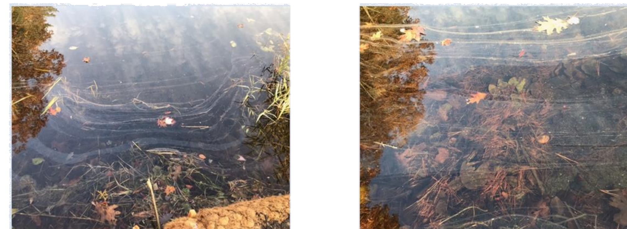
11/9/2021 at Back Pond/Causeway