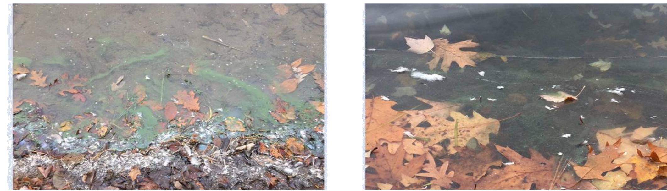
10/30/2019 at Causeway & Nature Center