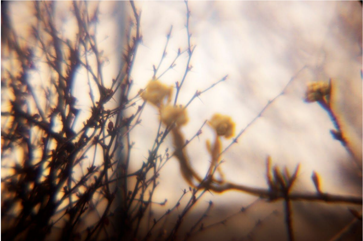
Figure 3. Image created homemade lens mounted on SONY Digital Camera