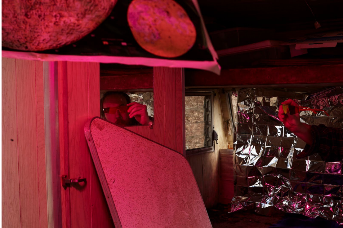
Figure 7.2 the character once again obscured by both futuristic sunglasses and through a mirror

The images allow the viewer to relate to the character and see what he is seeing. The audience both shares the character's perspective and fails with him over and over again. The slideshow asks the viewer to watch this character's slow demise over and over again as the only reality in "the cave." Is the audience watching their own dreams die with the character's? The viewer can't help the character build his makeshift spaceship and escape his dismal situation because that is the reality Ponderous Counterspectacle forces them to face. Half way through the production of this project about the end of the world, the world started to end.