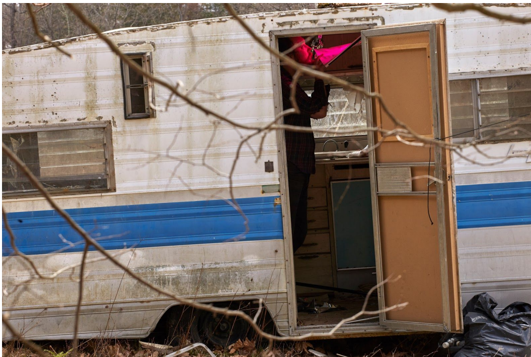
Figure 5. The character stares into a mysterious, unnatural light