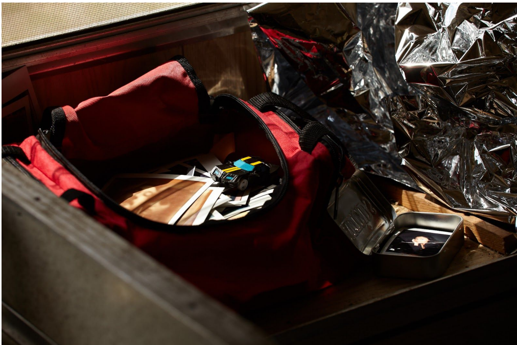
Figure 6.2 Photographs stored in a first aid kit, A single image separated symbolizing some significance