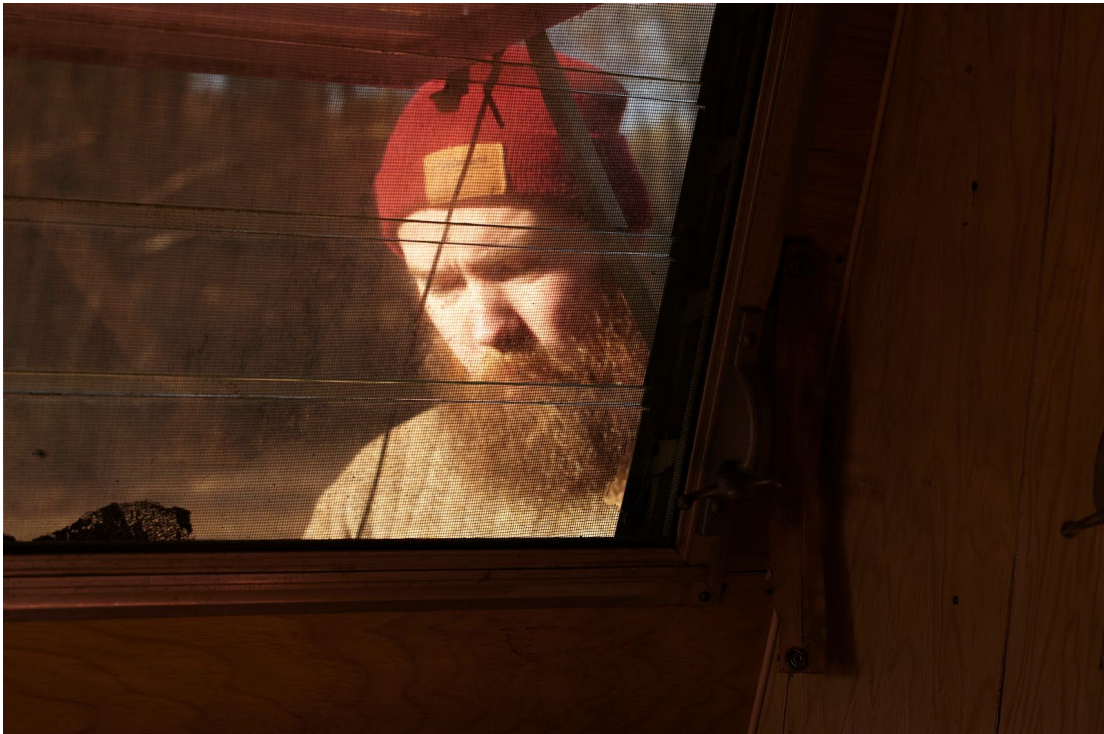
Figure 7.1 the character obscured by a dirty window

The character as seen in Ponderous Counterspectacle is seemingly alone. References are made in the photographs to a past life (Figure 6.1 & 6.2) the objects in these photographs imply nostalgia for a past life. The single image sitting outside of a larger bag of photographs implies a loss of someone important to the character. This gives the audience access into what the character may be feeling and helps them empathize with him. Although the character is alone, the perspective of the photographs switches during the slideshow from watching the character to seemingly a first person perspective. Is the viewer seeing the world from the character's eyes? Or is it their own? The photography deliberately creates a distance and often barriers to the characters identity (Figure 7.1 & 7.2).