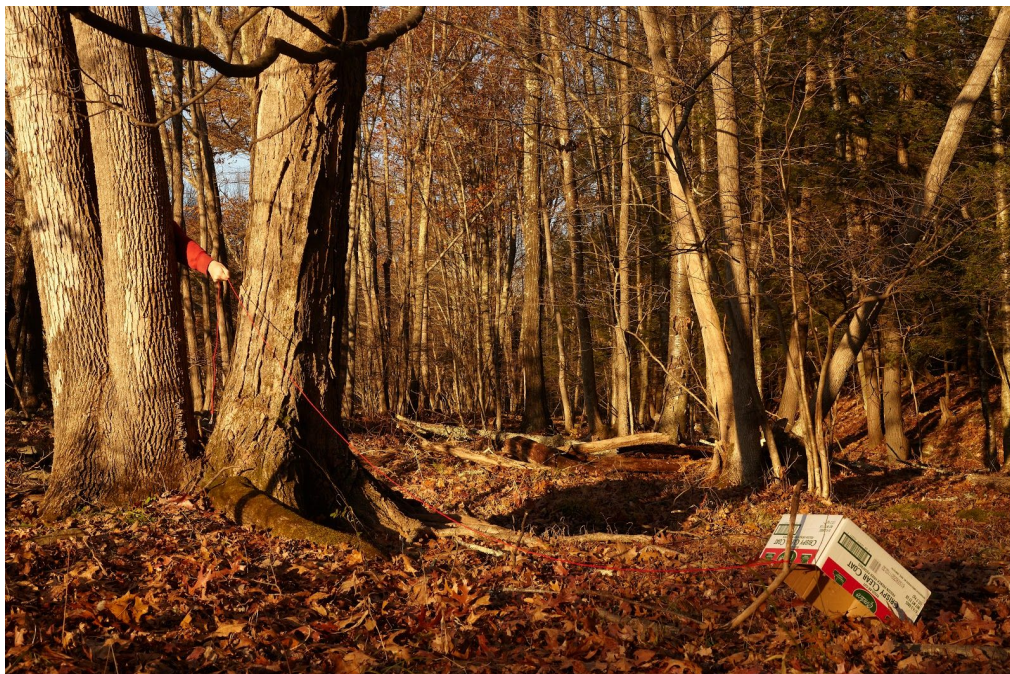
Figure 4.1 A hand reaches out from behind a tree ready to trigger a trap

The images are sequenced in such a way to imply a narrative arc of the character as well as formally alluding to the themes I am referencing. An image of a rudimentary box trap where a disembodied arm reaches out and holds the rope that will trigger it is placed next to another photograph of the RV where a log has been inexplicably placed leaning against the outside wall with a rope emerging from an unknown place (Figure 4.1 & 4.2).