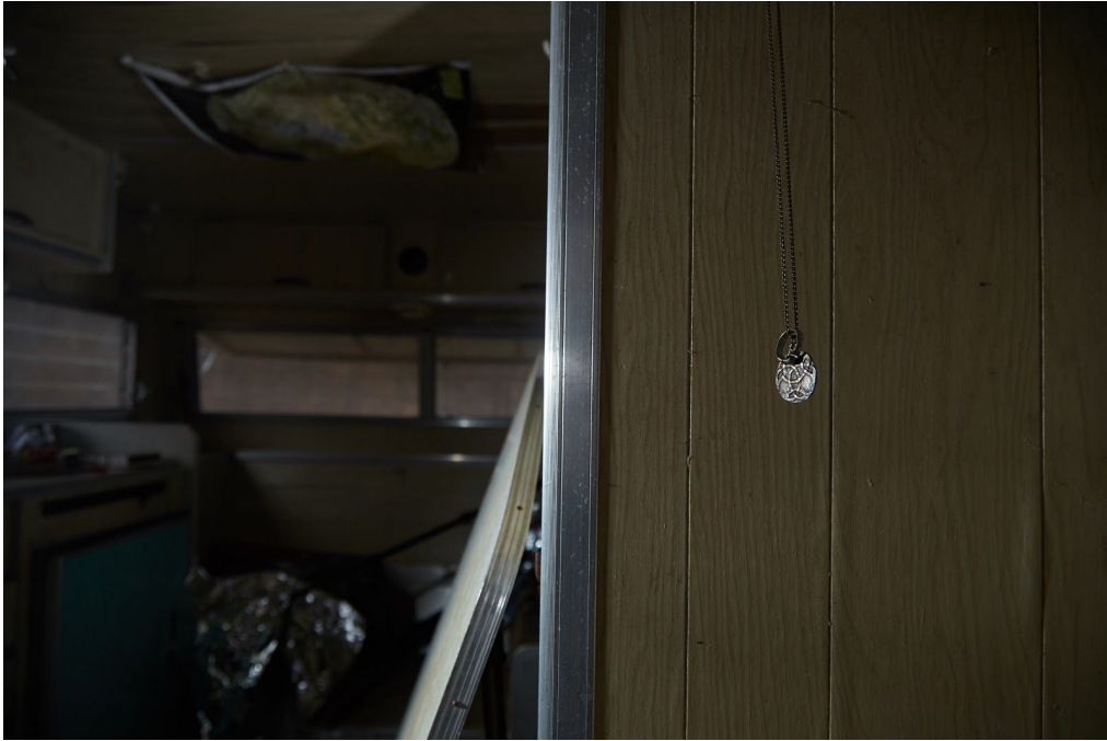
Figure 6.1 A memento from the past in front of a star map