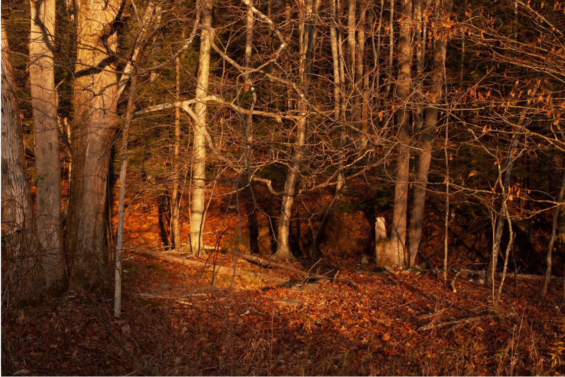
Figure 1.1 Photograph opened using Adobe Bridge Camera Raw