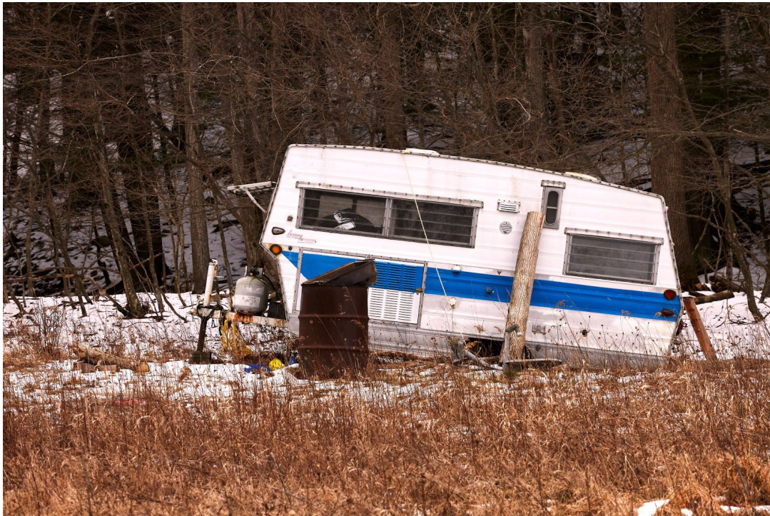
Figure 4.2 A random log leaned against the outside wall of an RV with a rope attached. Images is meant to make visual connection between the previous image