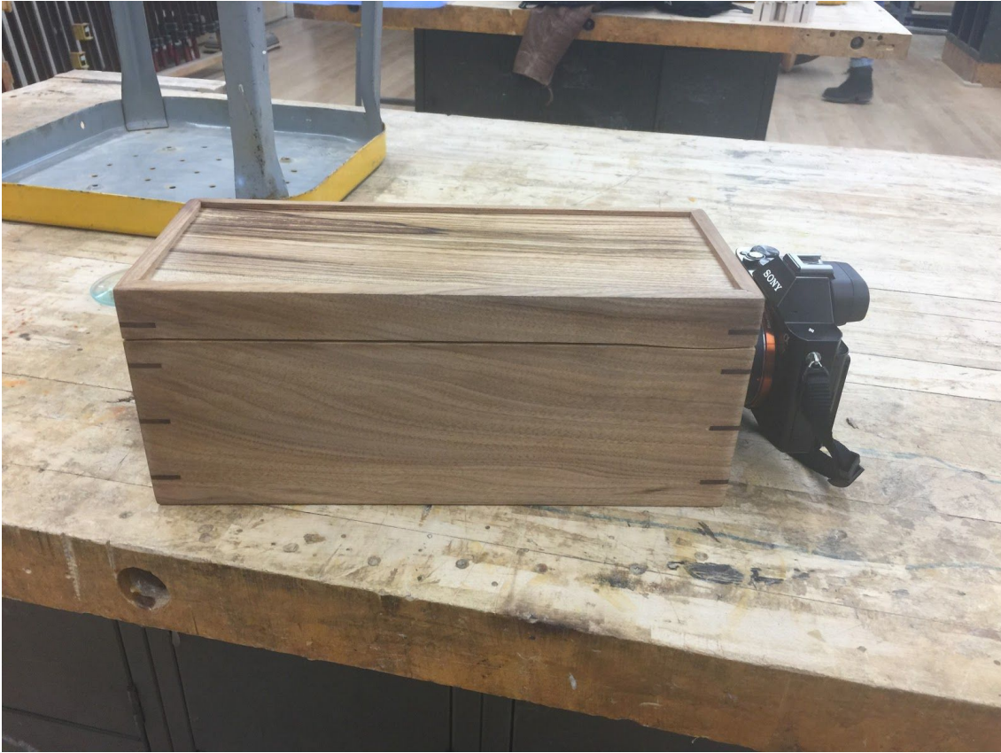
Figure 2. Handmade Lens mounted on SONY digital camera

The juxtaposition of the hand-made wooden lens attached to the $2000 digital camera was comical and brought up questions about craft vs. mass production. Ultimately though, the images I was able to produce with the lens weren't successful. The limitations of the focal length of the lenses forced the point of focus to about 10ft away from me holding the camera, and the lenses were so telephoto I could only make images that were zoomed in. Some of them were very pretty, but that was all they were. all of the photographs became so similar they weren't confronting the question of individuality and lacked the conceptual framework I was searching for in my project. (Figure 3) I realized the problem was that I was asking the wrong questions.