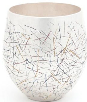
Heirloom #1, fine silver, india ink, 2020