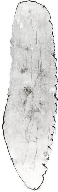
Accumulation #1 (brooch), fine silver, sterling silver, 2020