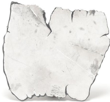
Accumulation #2 (brooch), fine silver, sterling silver, 2020