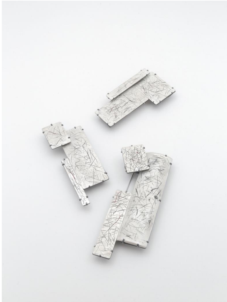
Trace & Month Series (brooches), fine silver, sterling silver, enamel, 2019