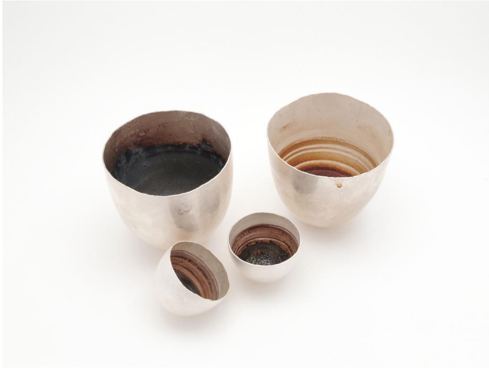
Conversation Collectors , fine silver, coffee, india ink, liver of sulfur, 2019