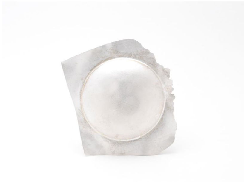
Trace Collector #2 (brooch), fine silver, sterling silver, 2020