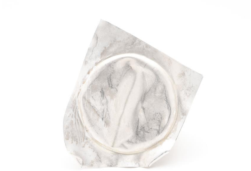
Trace Collector #1 (brooch), fine silver, sterling silver, 2020