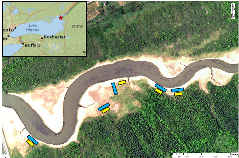
Fig. 1 Location and alignment (approx.) of the five treatment replicate blocks for the Meadow Zone (yellow) and Cattail Zone (blue) at Kents Creek, a drowned-river-mouth tributary to Lake Ontario. For ease of viewing, treatment blocks are not to scale

replicate block consisted of 1 m × 1 m plots that were staked with PVC pipe and separated by a 1 m × 1 m working area/buffer (Fig. 2). Treatments were applied in a complete factorial, random block design.