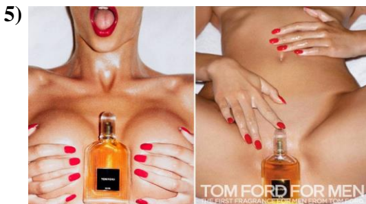
Figure 5: Tom Ford. "Controversial Campaigns: 9 Banned NSFW Fashion Ads You Probably Shouldn't See," by M. Stempien, 2015 ( www.justluxe.com/fine-living/chatter/feature-1960587.php ). In the public domain.