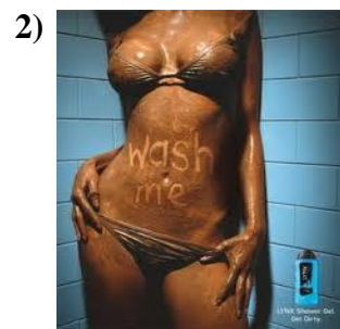
Figure 2: Axe. "Rage against the media, not against ourselves," by V. Rodriguez, 2014 ( womenandmediafa2014.blogspot.com/2014/10/rage-against-media-not-against-ourselves.html ). In the public domain.