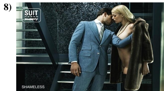
Figure 8: Suit Supply. "Whatever Wednesday: Tiiu Kuik for FLARE, Project Runway Winner, Shameless Suit Ads and more," by Beautifully Invisible, 2010 ( www.beautifullyinvisible.com/2010/11/whatever-wednesday-tiiu-kuik-for-flare-project-runway-winner-shameless-suit-ads-and-more.html ). In the public domain.