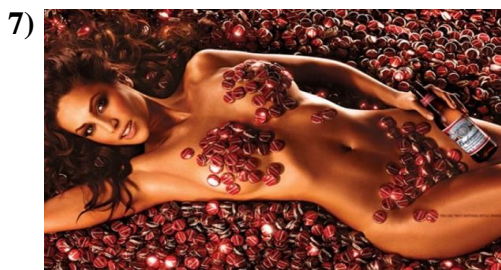
Figure 7: Budweiser. "Objectifying Women in Beer Advertisements," by Timali & Haya, 2013 ( https://sheisnotathing.wordpress.com/2013/11/01/objectifying-women-in-beer-advertisements/ ). In the public domain.