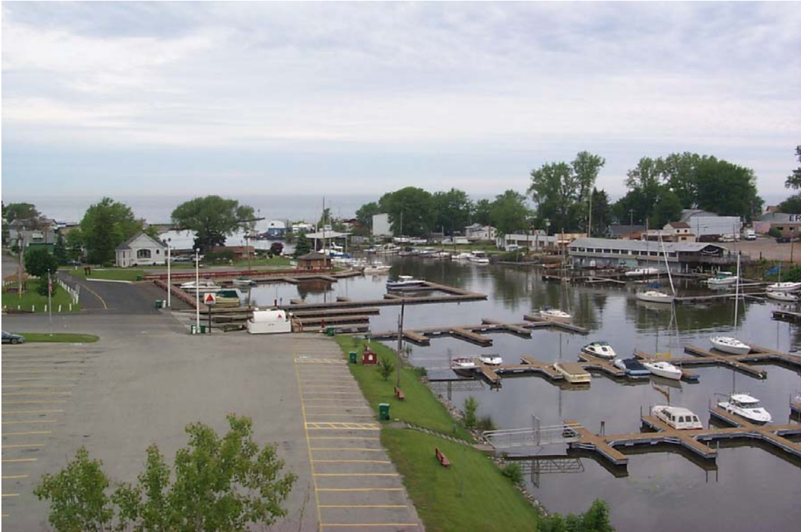
Olcott Harbor at Eighteenmile Creek