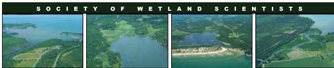
Braddock Bay Open Embayment