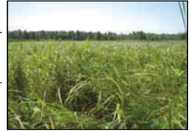
Sedge/grass meadow marsh