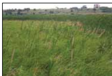
Cattail invading meadow marsh

The results suggest that canopy-dominating, moisture-requiring cattails were able to invade meadow marsh at higher elevations because sustained higher lake levels allowed them to survive and outcompete sedges and grasses that can tolerate periods of drier soil conditions.