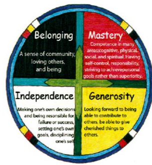
Figure 3. Circle of Courage, Indigenous Youth Development Model