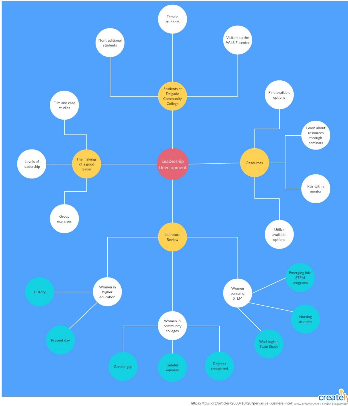
Figure 3. Model of project in all of its components.